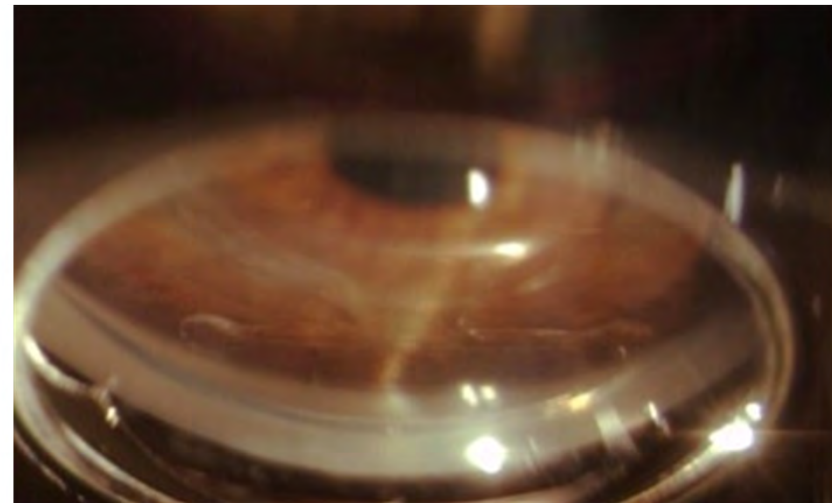
Haptics viewed by gonio