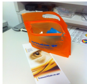
Handling the postop instructions & drops