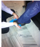
Preparing patient with OR clothing