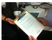
Documenting: Reading and signing the "Informed Consent"