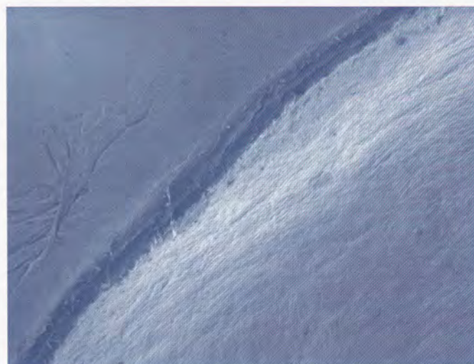
Figure 3: Stromal Bed Quality Observed Using the WaveLight® FS200 Laser